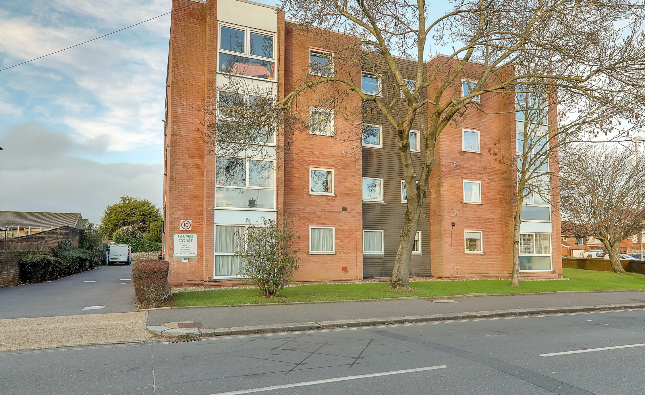
7 Laurier Court Northcourt Road, Worthing, BN14 7DE £950 Per Month